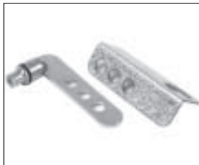
2530-PL - replaces 1/4 turn insert. (Galvanized & chrome plated.)