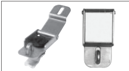
Covers 1/4 turn catch to prevent access (stainless steel). PH – For all metal enclosures PCC – For nonmetallic enclosures