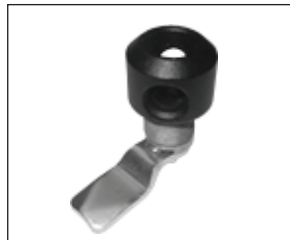
Z3013 - 1/4 turn padlock hasp (Lock not included.)