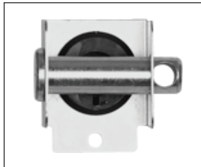
EC – Covers 1/4 turn catch to prevent access (zinc plated).