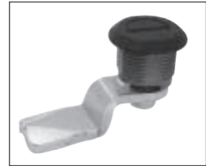
Z-2031-A – slot 1/4 turn (Vision Series) Z-2031-B – slot 1/4 turn (N12 & N4X Series) ALLS-304 – Stainless DIN 1/4 turn (LSK503 DIN key not included)