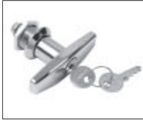
ALT 561 T HANDLE (chrome plated) 1/4 turn latch with key lock