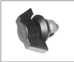
Z-2034 WING KNOB 1/4 TURN LATCH