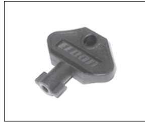
LSK-502 PLASTIC KEY FOR DIN 3 mm LATCHES