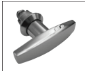
ALT 561XCE T HANDLE (chrome plated) 1/4 turn latch