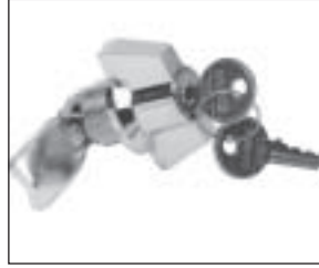
ALT 562 WING KNOB KEY LOCK (chrome plated)