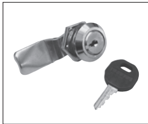
ALL-508 CHROME KEYED LATCH