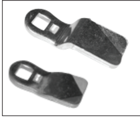
Locking cams for latches Z-2050 – For use with N12 & N4 series (top image) Z-2051 – For use with Vision series (bottom image)