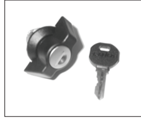
Z-2011 WING KNOB KEY LOCK