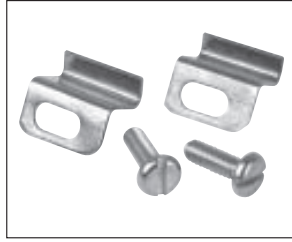
Z-3010 REPLACEMENT IB DOOR CLAMP HARDWARE (2 per package)