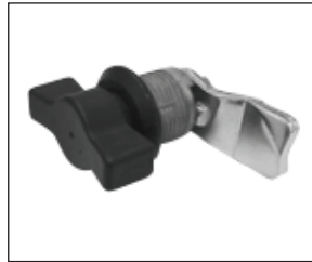
Z-2033 WING KNOB 1/4 TURN LATCH