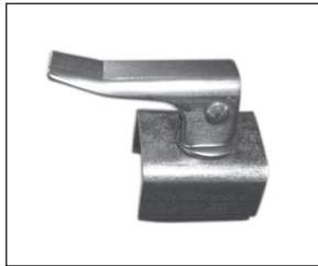
N4 SERIES QUICK RELEASE CLAMP Replaces standard clamp screw (1 per package) NH-40151 – Stainless Steel