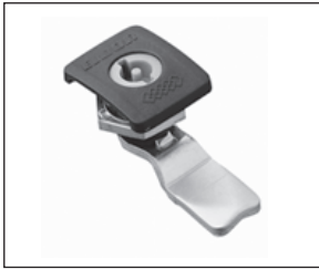
ALL-503 DIN 3 mm TYPE LATCH (Non Metallic)