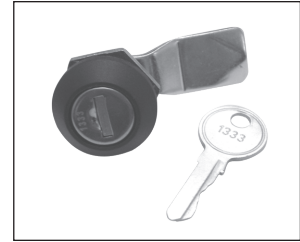
ALL-509 KEYED LATCH