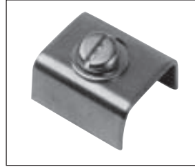
Z-3011 – REPLACEMENT N4 DOOR CLAMP HARDWARE (2 per package)