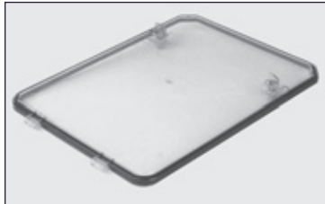
** INSPECTION COVER Transparent Cover mounted on hinge frame