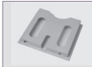
NON METALLIC PRINT POCKET DRA4 9.25" H x 10.5" W x 1.25" D Light Grey - Self Adhesive (Not suitable for MIP-325 or MIP-43)

* = Mounted on hinged frame ** = Mounted on two hinged pins