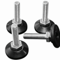
Levelling Feet (4 per pack)