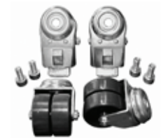
Castors (4 per pack)