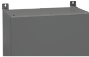
Wall Fixing Brackets (2 per pack)