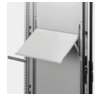
Folding Door Shelf/Desk