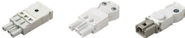
FEMALE / MALE CONNECTORS WHEN PROVIDING YOUR OWN CABLE