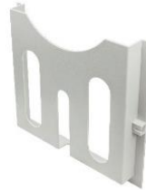
Document Pocket Part No. DP-01