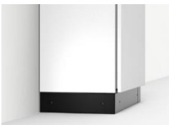
Plinth Depth Section (2 per package)