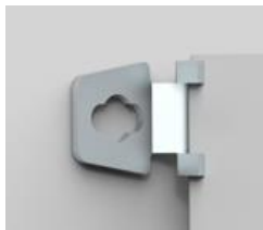
MAP Wall Mounting Bracket Set of 4 brackets