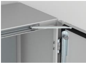
EWS Series Door Stop Part No. ADO-202