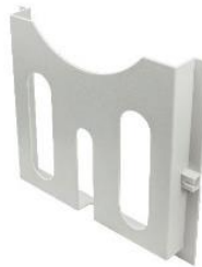
Document Pocket Part No. DP-01