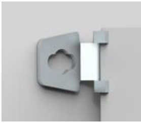
MAP Wall Mounting Bracket Set of 4 brackets Part No. AW41